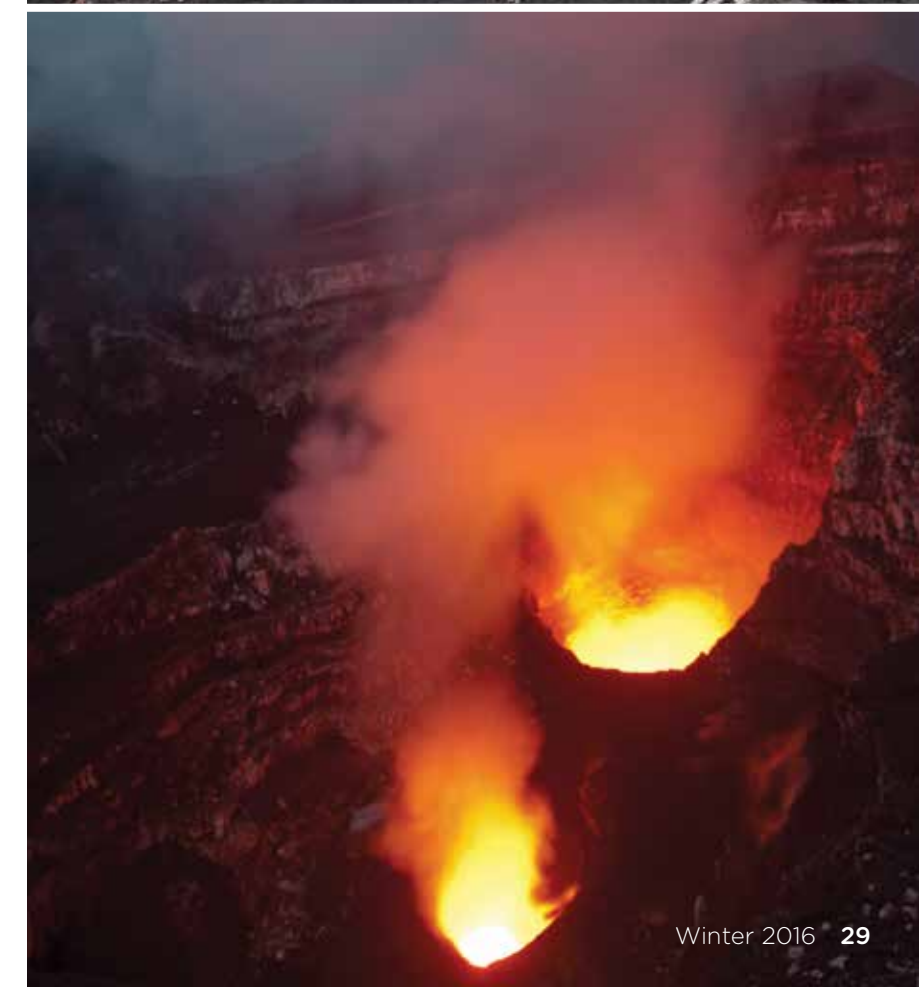
Opposite