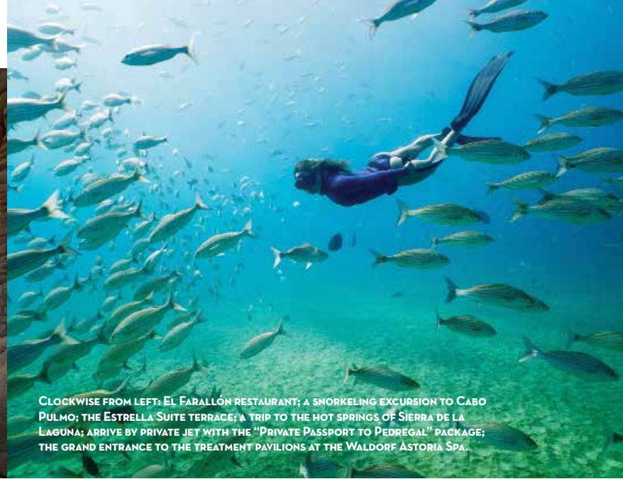
CLOCKWISE FROM LEFT: EL FARALLÓN RESTAURANT; A SNORKELING EXCURSION TO CABO PULMO; THE ESTRELLA SUITE TERRACE; A TRIP TO THE HOT SPRINGS OF SIERRA DE LA LAGUNA; ARRIVE BY PRIVATE JET WITH THE "PRIVATE PASSPORT TO PEDREGAL" PACKAGE; THE GRAND ENTRANCE TO THE TREATMENT PAVILIONS AT THE WALDORF ASTORIA SPA.