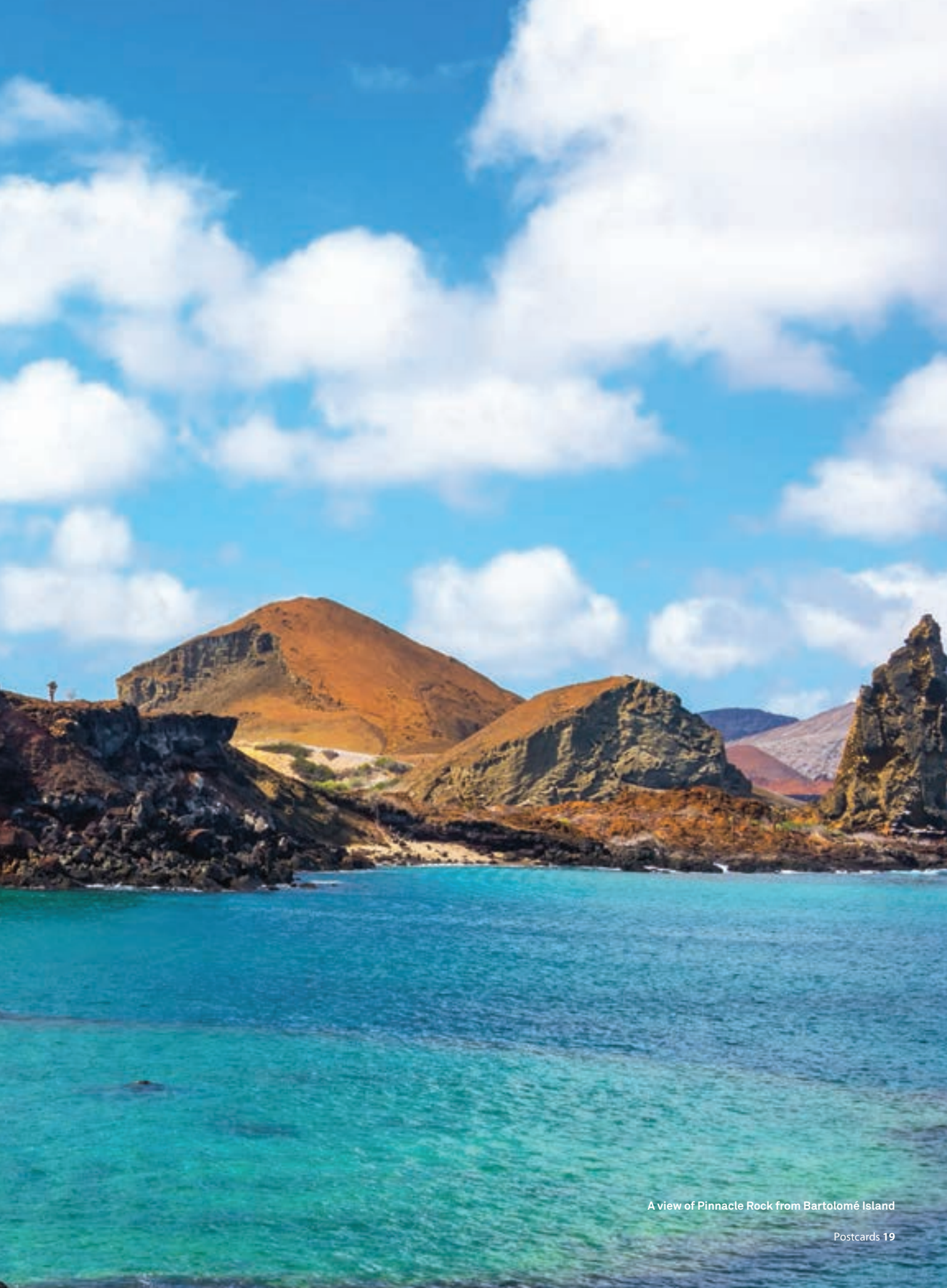
A view of Pinnacle Rock from Bartolomé Island