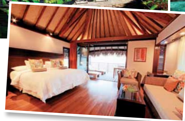
PARADISE FOUND AT THE HILTON MOOREA LAGOON RESORT AND SPA, CLOCKWISE FROM LEFT: INTERIORS OF AN OVER-WATER BUNGALOW; THE PRINCIPAL SWIMMING POOL; A SUBLIME ALFRESCO DECK OF AN OVER-WATER BUNGALOW; THE SCENE AT SUNSET; THE FAVORITE LOCAL DISH, POISSON CRU.

(endemic Hawaiian geese) and watch the red-footed boobies take flight at the Kilauea Lighthouse. In Hanalei, pop into Yellowfish Trading Co. to pick up a few vintage and modern Hawaiian souvenirs for friends and family back at home. Oh, and don't forget those "Wishing You Were Here" postcards. ( stregisprinceville.com )