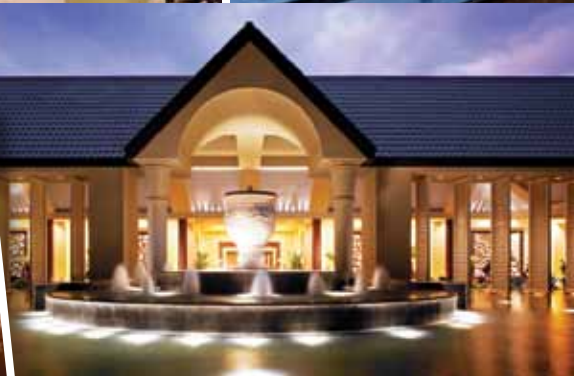
ST. REGIS PRINCEVILLE, CLOCKWISE FROM BOTTOM LEFT: THE ST. REGIS BAR; A BEACHFRONT CABANA FACING HANA-LEI BAY; A TREATMENT ROOM AT THE HALELE'A SPA; MAIN LOBBY; THE VIEW-HEAVY MAKANA TERRACE (ALSO OPENING PAGE); THE RESORT'S GRAND ENTRANCE.