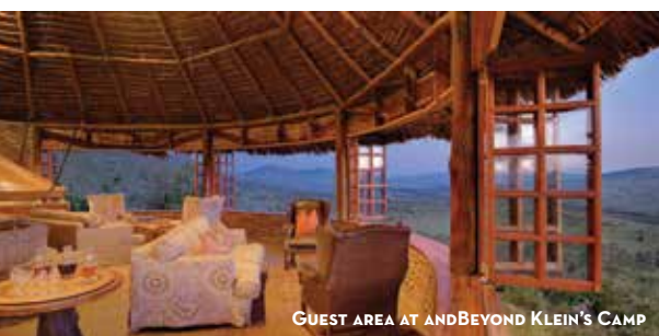
GUEST AREA AT ANDBEYOND KLEIN'S CAMP