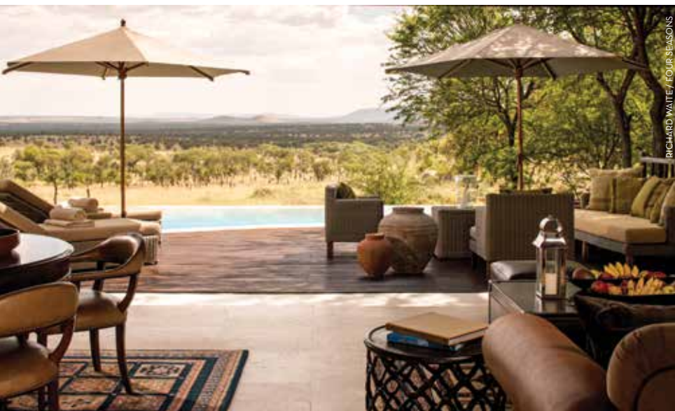
RICHARD WAITE / FOUR SEASONS