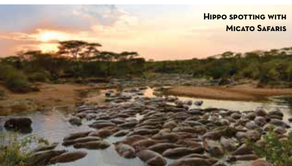
HIPPO SPOTTING WITH MICATO SAFARIS