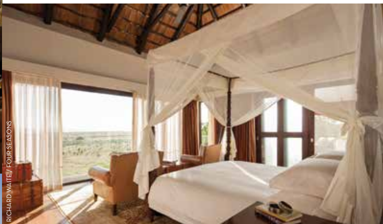
RICHARD WAITE / FOUR SEASONS