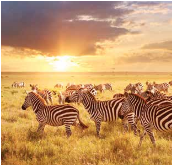
RICHARD WAITE / FOUR SEASONS