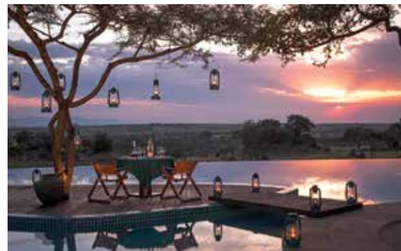
RICHARD WAITE / FOUR SEASONS