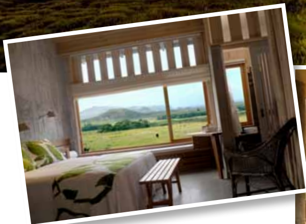
CLOCKWISE FROM ABOVE: ROOM AND EXTERIOR OF EXPLORA RAPA NUI; ONE OF THE ISLAND'S MANY MOAIS; THE BAR AT EXPLORA RAPA NUI; BIRDMAN PETROGLYPH AT RANO KAU.