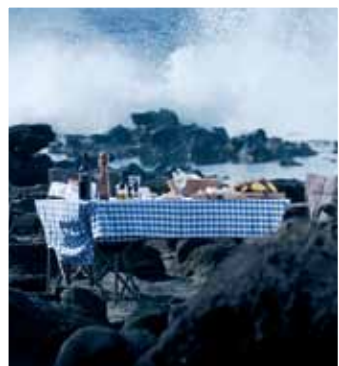
ENJOY A PICNIC OR A HIKE ON THE COASTLINE AND EXPERIENCE THE CULTURE OF RAPA NUI THROUGH DRESS AND DANCE.

ing 15 strong along the island's southeast shoreline. And you won't want to miss spelunking through Las Dos Ventanas cave and later ascending Rano Kau crater, the site of Easter Island's famous Birdman competition and a nineteenth-century worship grounds.