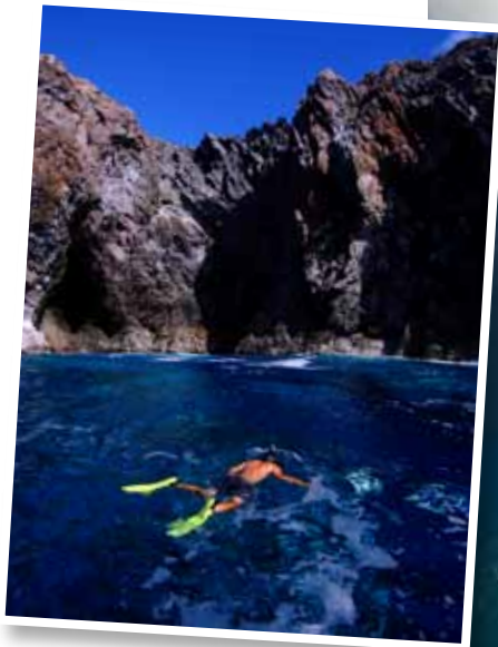
EXPLORATIONS WITH EXPLORA, CLOCKWISE FROM ABOVE: SNORKELING IN THE PACIFIC OCEAN; RANO KAU CRATER; AHU TONGARIKI; AERIAL VIEW OF EXPLORA AND EASTER ISLAND.