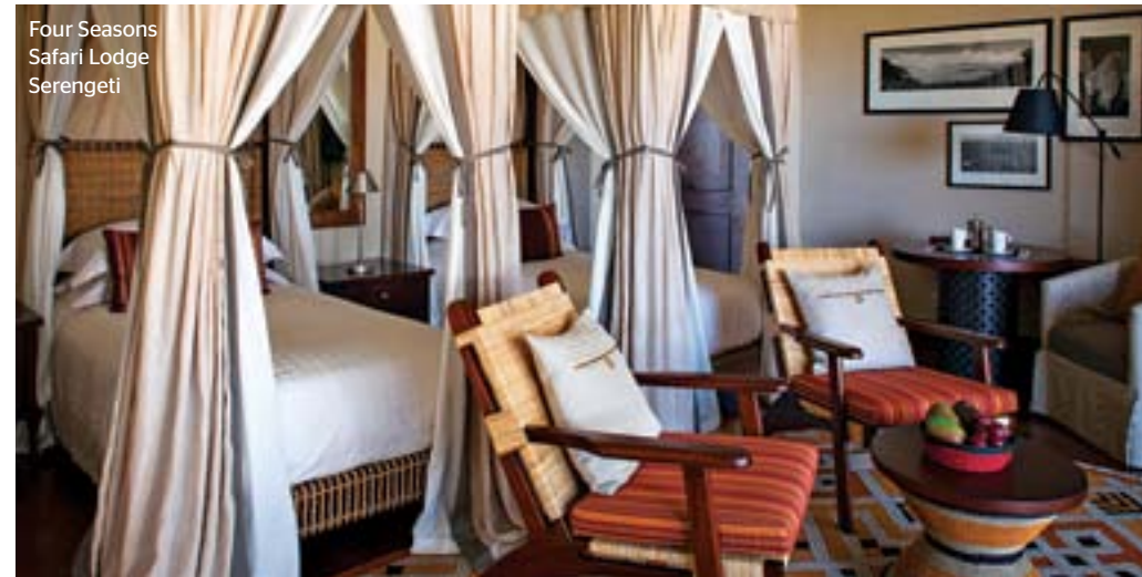
Four Seasons Safari Lodge Serengeti