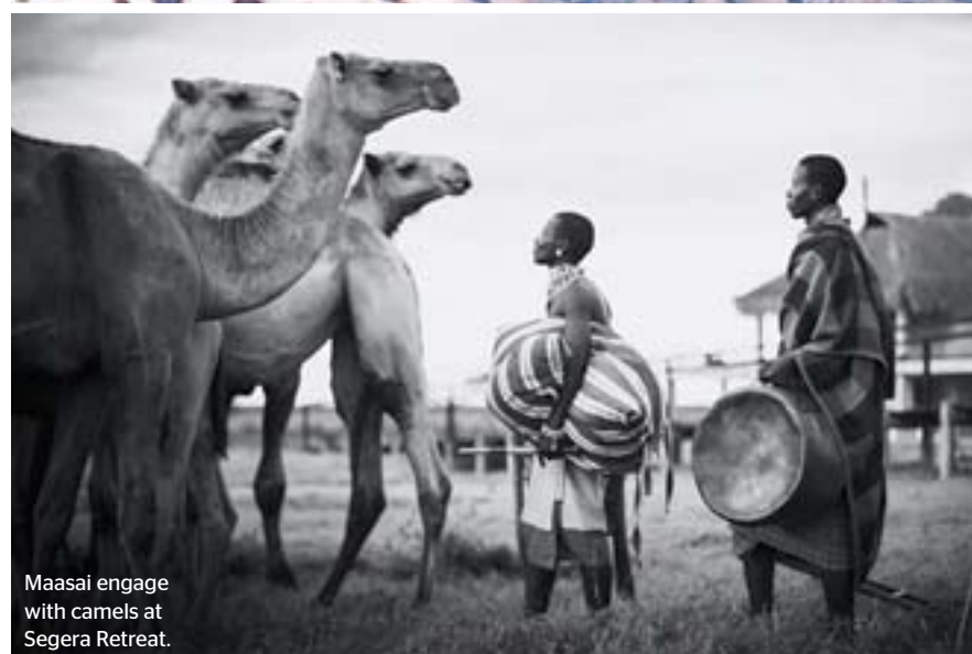
Maasai engage with camels at Segera Retreat.