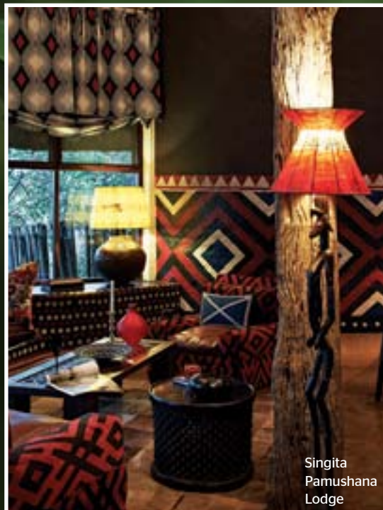
Singita Pamushana Lodge

Wilderness Safaris has unveiled two of its Wilderness Collection camps, the Odzala Camps , in Odzala-Kokoua National Park, which boasts the world's highest density of western lowland gorillas.