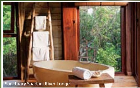
Sanctuary Saadani River Lodge

The seven-villa Singita Pamushana Lodge handsomely rewards those venturing down the road less traveled with the extreme natural splendor of the Malilangwe Wildlife Reserve and an unexpected immersion into Zimbabwean cultural heritage. With Zimbabwe's political turmoil finally subsiding, Pamushana and other national lodges are enjoying some long overdue attention.