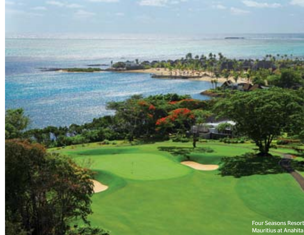
Four Seasons Resort Mauritius at Anahita