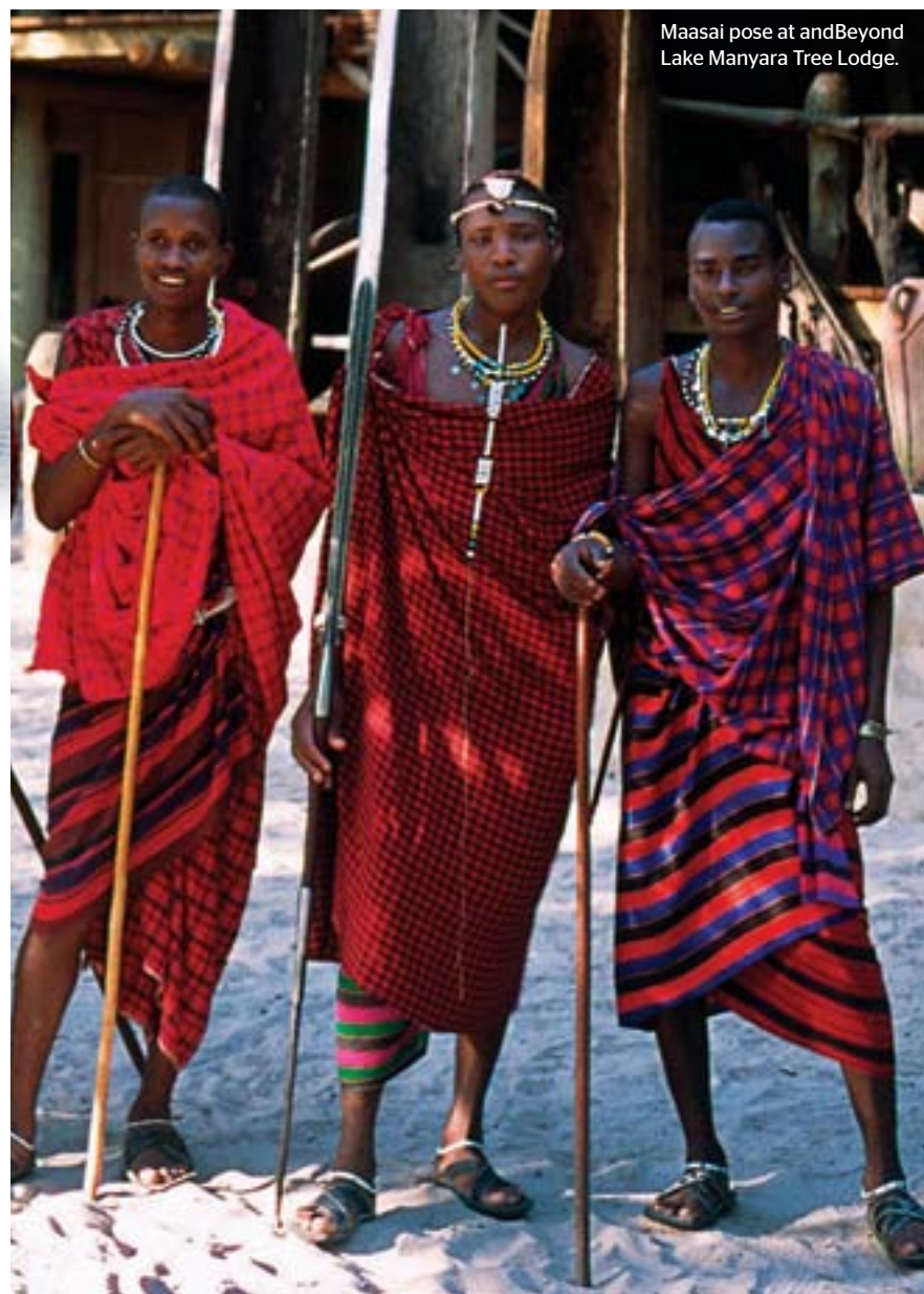
Maasai pose at andBeyond Lake Manyara Tree Lodge.

For families Singita properties offer a full roster of activities to keep kiddos entertained. At its latest endeavor, the Singita Serengeti House , the savanna transforms into a fun house with children's activities that include archery, baking, and a Mini Rangers course, where they identify wildlife tracks and study butterflies.