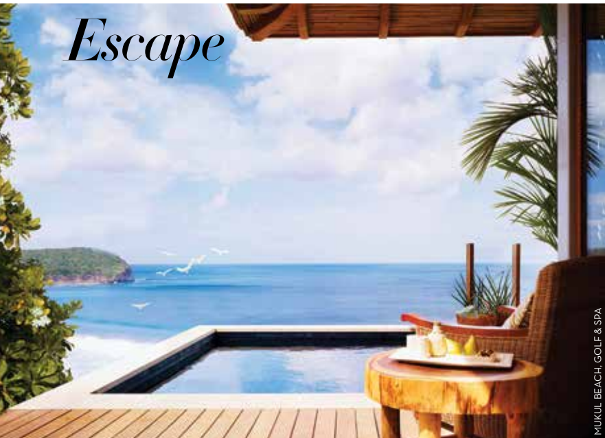
MUKUL BEACH, GOLF & SPA