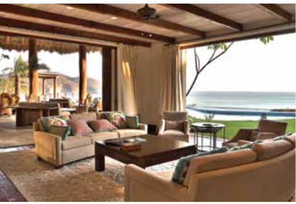
FOR MORE LUXE ACCOMMODATIONS, OPT FOR A SUITE, LIKE THE CASONA DON CARLOS (ABOVE) OR THE DOÑA VIVIAN (RIGHT).