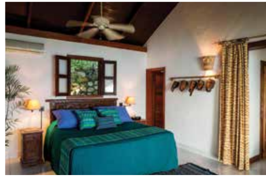
BASK IN NATIVE SURROUNDS IN LA LANCHA'S NEWLY RENOVATED LAKE-VIEW ROOMS (LEFT) AND ON THE FURNISHED DECK (BELOW).