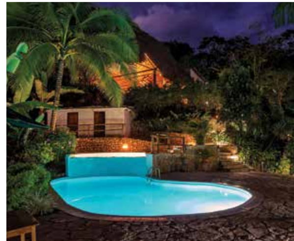
EXPLORE THE ANCIENT MAYAN CITADEL TIKAL (LEFT) BY DAY AND RELAX IN THE LAKESIDE POOL BY NIGHT (ABOVE).