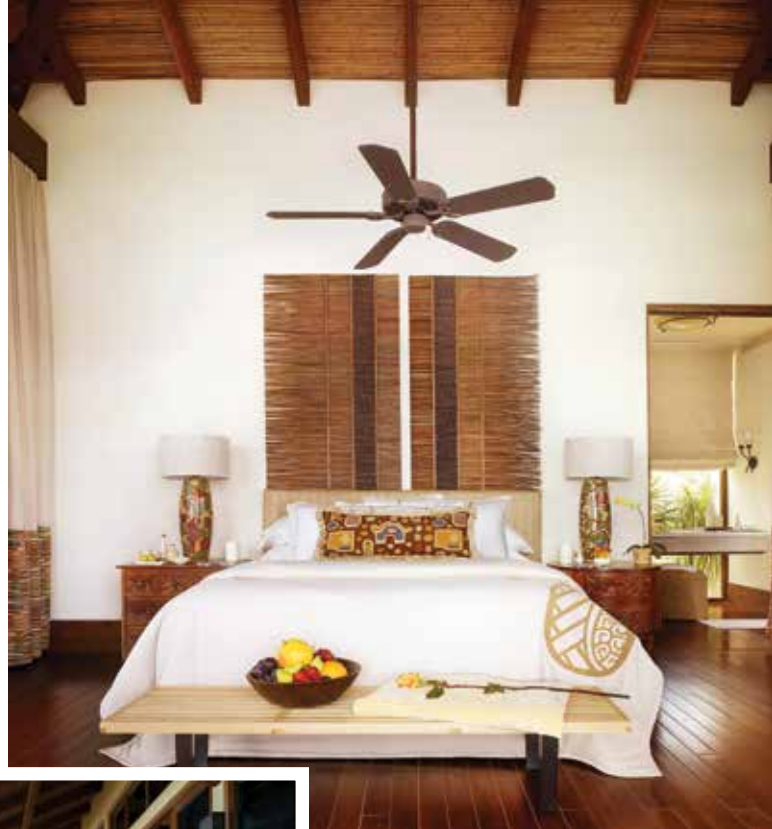
MUKUL'S BOHIOS, MADE FROM NATIVE TEAK AND PINE, HOUSE PRIVATE AMENITIES LIKE LARGE DECKS AND PLUNGE POOLS.